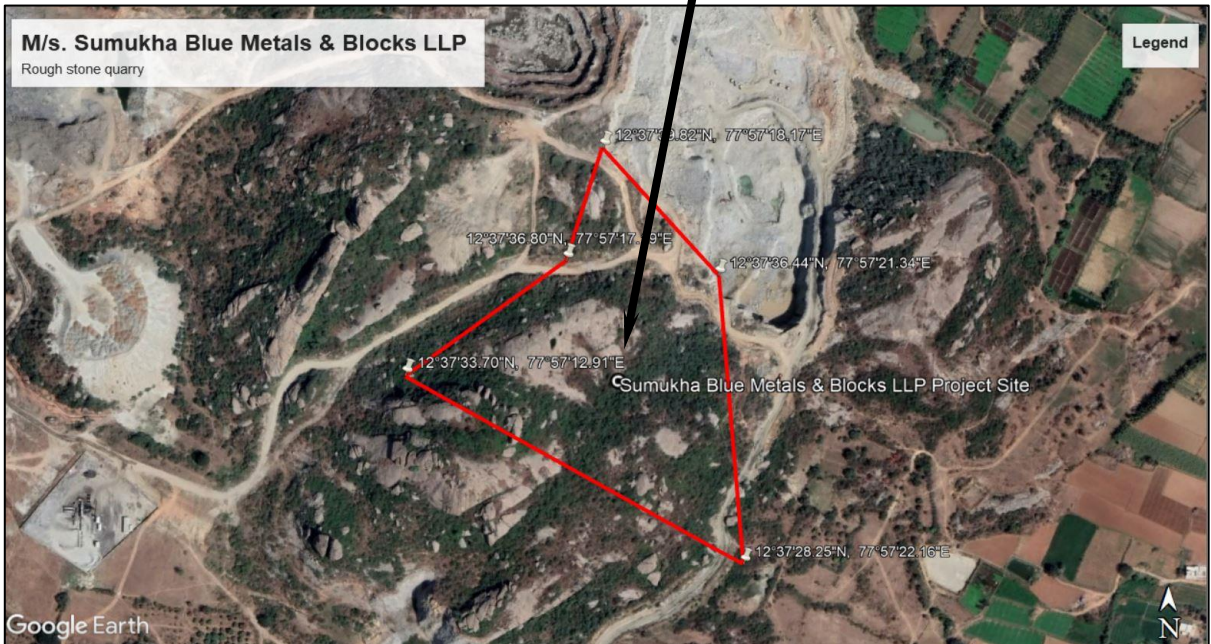
Figure 2: Google Image of the Project Site