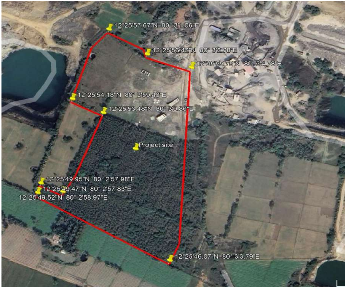
Figure 2: Google Image of the Project Site