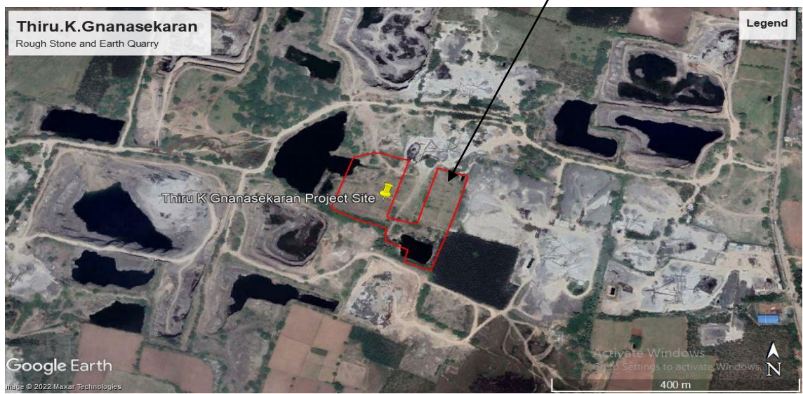
Figure 1: Location Map of the Project Site