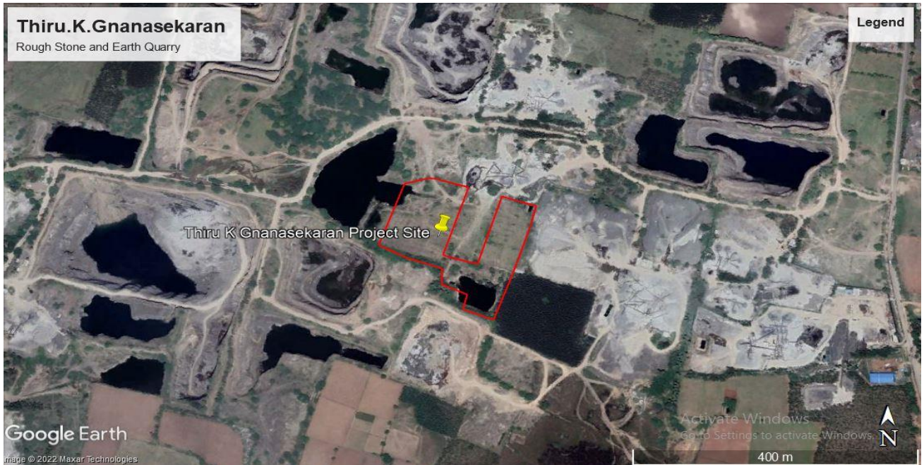
Figure 2: Google Image of the Project Site