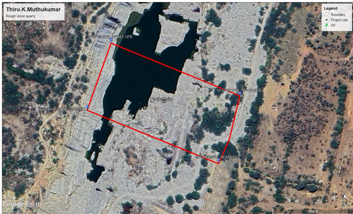
Figure 2: Google Image of the Project Site